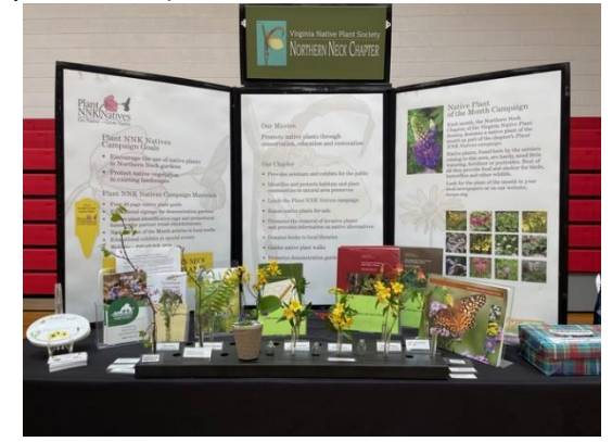
Our lovely display shines with small vials of wildflowers