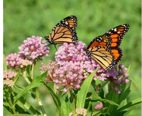
Monarchs nectaring on Swamp Milkweed