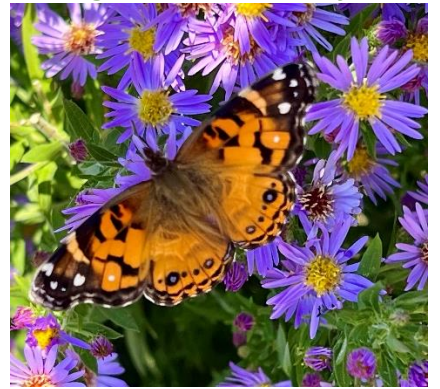
American Lady on Aster

What can you do to promote Biodiversity on your own property? Shrink your lawn, Plant native species such as Oaks, native cherry, willows, or birches or herbaceous perennials such as asters, goldenrods or sunflowers that support hundreds of species of wildlife; Plant for specialist pollinators that are often dependent on a single genus or species of plant – like the Monarchs and milkweed, Plant generously and in layers – plant a dogwood or serviceberry under your Oak and surround this with shrubs and an herbaceous groundcover as a "living mulch". Refer to our guide, Native Plants for the Northern Neck for more beautiful and ecologically rich plant choices.