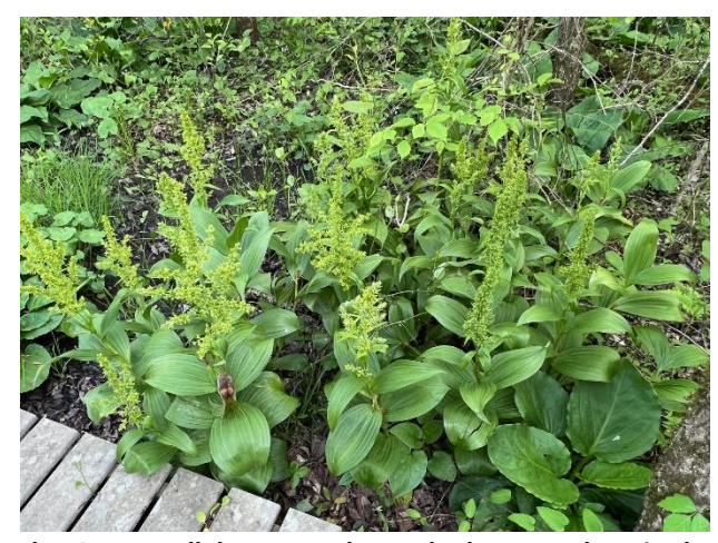
False Green Hellebore – HH hosts the largest colony in the Coastal Plain of the N.A.