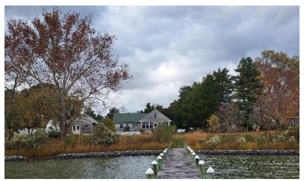
Low Marsh Salt Meadow Salt Panne Upland Bank Landward limit of tidal marsh Regular inundation Periodic inundation Infrequently inundated with salt concentrated No inundation

Carol explained that we must protect our shorelines from both the water side and the upland side. Shorelines themselves consist of low marsh, salt meadow, and high marsh or salt panne. Salt grasses are the main plants to use in the low and high marshes, with the additional introduction of salt bushes and salt tolerant perennials in the high marsh. In addition, there needs to be a viable riparian buffer planted above the shoreline with all types of native plants, including deep-rooted grasses, perennials, shrubs, and trees, even if (or maybe especially if) you have a hardened shoreline to protect your shoreline and the Bay from erosion. To learn more or to apply for a Shoreline Evaluation, check out: Shoreline Evaluation Program | Northern Neck Master Gardeners (nnmg.org) or VIMS Field Guide to Virginia's Marsh Plants.