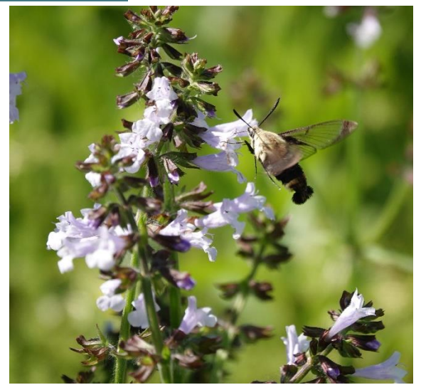
Snowberry Clearwing Moth Nectaring on Lyre-leaf Sage