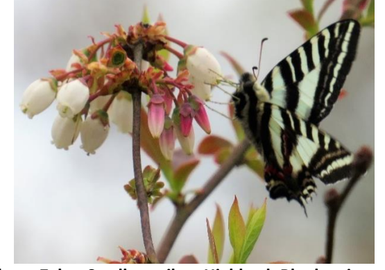
Zebra Swallowtail on Highbush Blueberries

Asters and Goldenrods top the list of the best herbaceous perennials by supporting over 100 species of butterflies and caterpillars and 33 species of specialist bees. While Milkweeds don't top the list, they are a 'poster child' as a host for the endangered specialist Monarch butterfly. The blueberries in the genus Vaccinium support over 100 species of butterflies and moths (baby bird food!) and 33 species of specialist bees. Plant some of these high wildlife value species this spring!