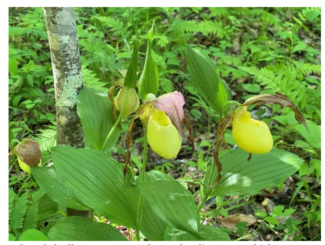
The globally rare Kentucky Lady Slipper Orchids In Cabin Swamp at Hickory Hollow

by 1:00 pm. Wear sturdy walking shoes and dress for the field with insect repellent, etc. Much of the walk will be on level ground on the White trail but the path down to Cabin Swamp is somewhat steep and narrow. A preview of some of the fabulous plants that should be blooming and flaunting their glory include the rare Kentucky Lady Slipper Orchid, Purple Twayblade, Green False Hellebore, Solomon's Seal, Wild Ginger, statuesque swamp ferns like Cinnamon, Royal ferns that can reach up to 4 or 5' tall in rich moist soils, as well as the diminutive Grape and Adder's Tonge ferns.