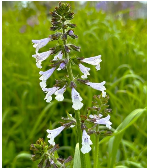
Lavender blue tubular flowers in whorls

This beautiful plant is highly adaptable, growing in full sun to partial shade and in dry soils or those that are occasionally wet. It even tolerates mowing and foot traffic and can be used as a lawn alternative. During late April and May this beautiful wildflower can be seen growing in extravagant abundance in fields and along our roadsides creating a lovely sea of soft -lavender blue blooms. This is a testament to the sheer adaptability and rugged nature of this native wildflower. Its tubular flowers attract a variety of long-tongued bees, hummingbirds and hummingbird moths to its nectar and is deer and rabbit resistant as well. Read more at <a href="https://www.nnvnps.org">www.nnvnps.org</a>